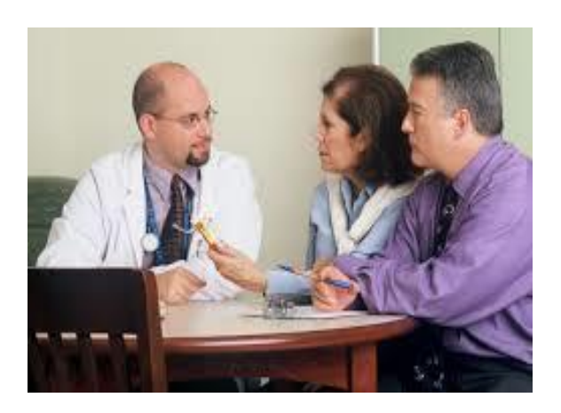
Czy trudno ci sie porozumiec ze swoim lekarzem?