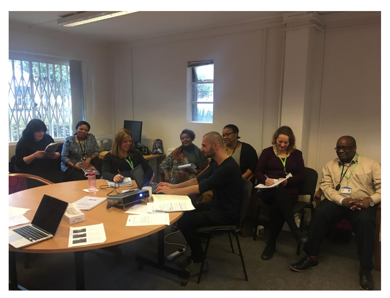
A training session for the Newham Community Recovery Team

At the outset of the Project's engagement with health professionals, observational notes from training sessions and face-to-face meetings indicated low levels of awareness of Roma. Training participants in particular displayed an almost complete lack of awareness of Roma as a distinct ethnic group and of the presence of Roma populations in the areas covered by their services. However, once provided with information about Roma culture, discrimination against Roma and conditions of disadvantage, professionals reported intentions to actively counteract stereotyping and discrimination against Roma in their practice. The Project's network of contacts with mental health services in East and North East London expanded steadily over the Project's life, and Project team members observed that they were encountering fewer professionals with no prior knowledge of the Roma community.