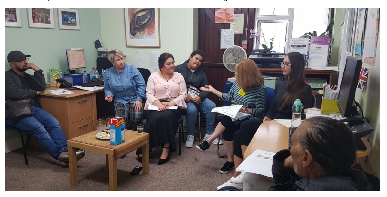
Peer Support Group on anxiety delivered by psychotherapist from CAMHS

'Peer Support Groups allowed me to meet mental health professionals and see that they just want to help. I then made a decision to access counselling.'