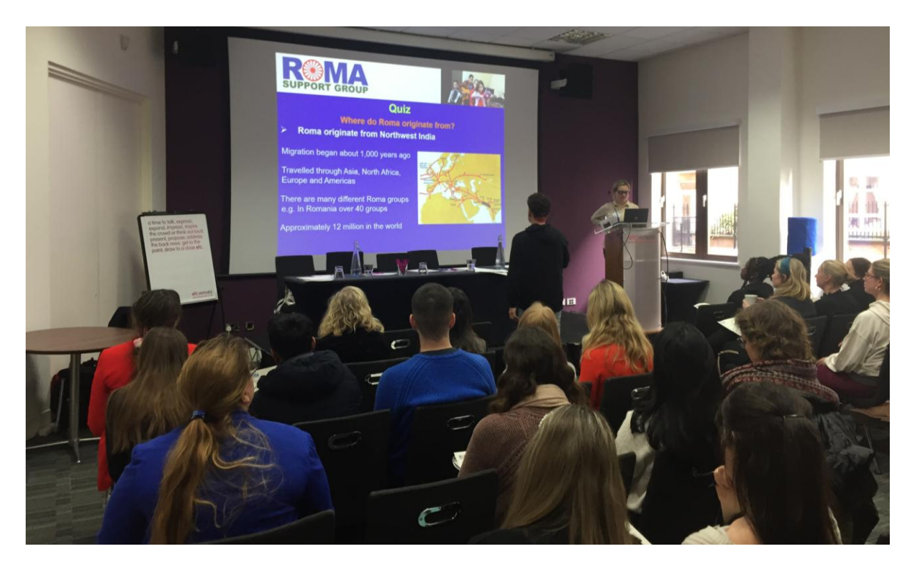
Presentation for health professionals delivered at the health conference in February 2020