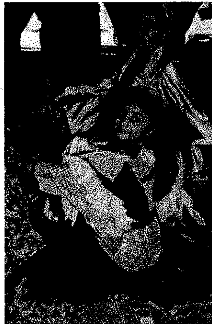
These young performers have grown in stature and have now become regular players in many different events.

Romani rad is a group of young Roma dancers and musicians from Poland. The group was formed in the spring of 1999 on the basis that they wanted to show and share their culture with audiences in the London region. Since tentative first beginnings, these young performers have grown in stature and have now become regular players in many different events and festivals throughout London. The exotic and colourful costumes are all designed and hand made by Roma women. Theirs is the tradition expressed by costumes, music and dance, the skills of which are handed down to them throughout the generations. Music is part of their life, it is not just an entertainment. It is a means of communication and part of their ritual of life, from wed